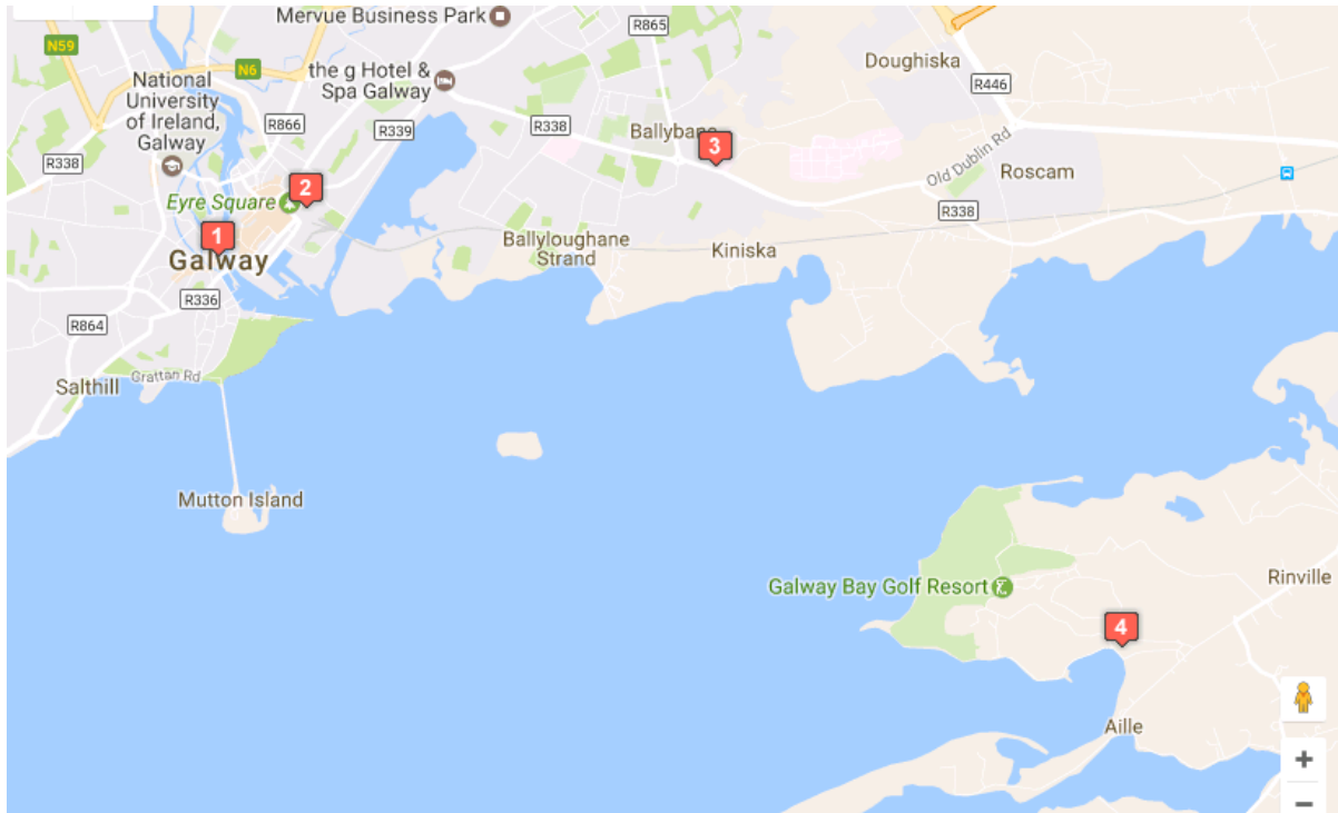
1 – Galway City