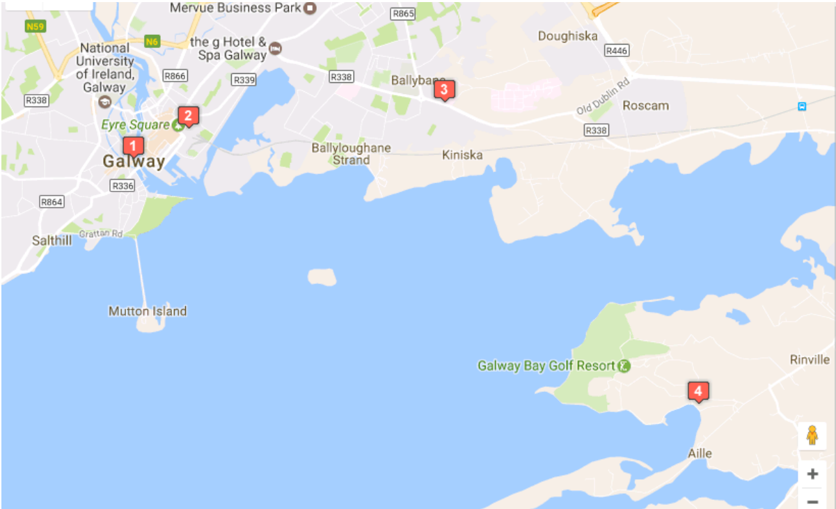
1 – Galway City