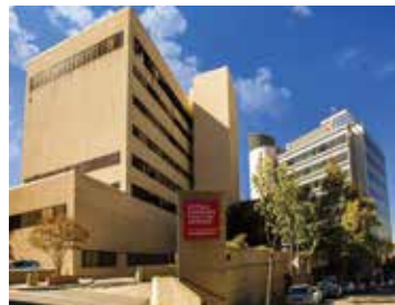
USC Norris Comprehensive Cancer Center and Hospital (NOR)