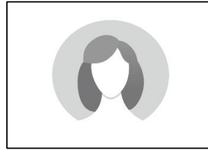
CEO In Process

Boston Scientific (NYSE) Delphi Technologies (NYSE) EnerSys (NYSE) Echo Global Logistics (NASDAQ)