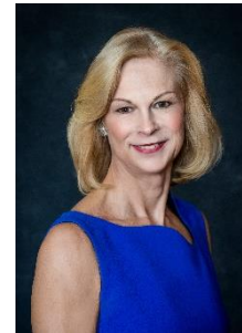
Christie Hefner Board Director: CHAIR, HatchBeauty Brands, R.D. Offutt, Edge Beauty