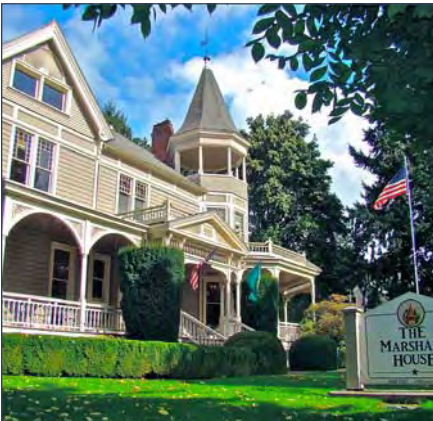
The Marshall House at Fort Vancouver