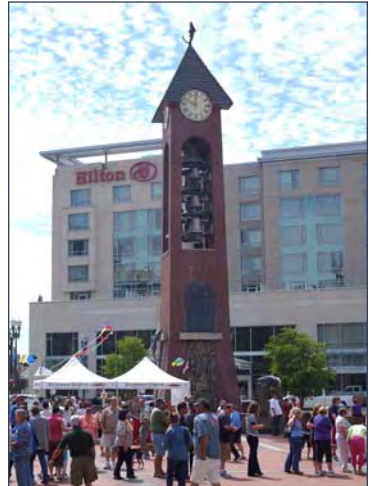
Salmon Run Bell Tower and Glockenspiel