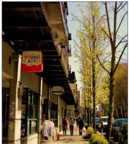
Downtown Vancouver

Tripp Muldrow, Arnett Muldrow & Associates