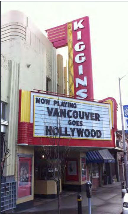
Historic Kiggins Theatre in downtown Vancouver