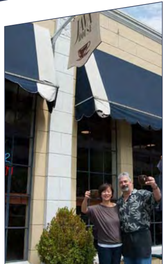
The Java House