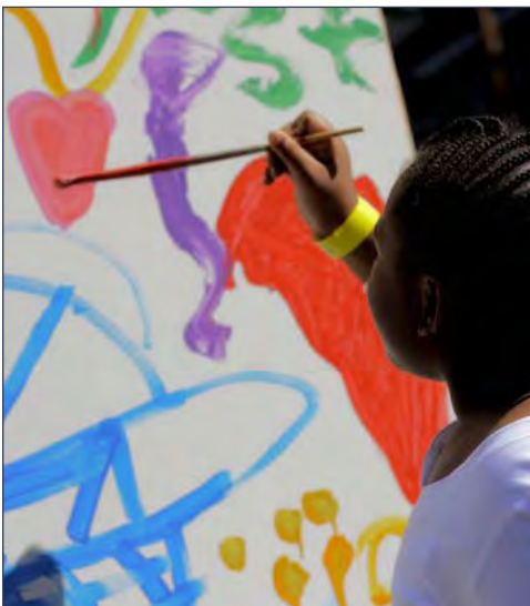
Compassion Vancouver