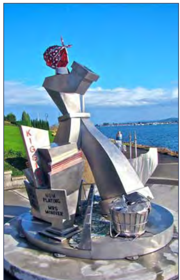
"Wendy Rose" sculpture on the waterfront.