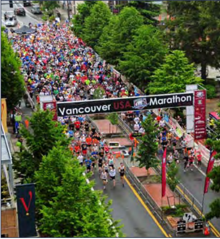
The annual Vancouver Marathon