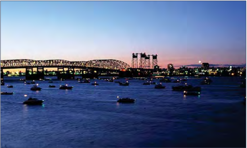
Columbia River at sunset

The Washington Trust for Historic Preservation and the Washington Main Street Program are delighted to welcome you to Vancouver for the third annual RevitalizeWA Preservation and Main Street Conference! We invite you to enjoy the wide array of educational sessions, workshops, tours and networking opportunities available over the next few days. Don't miss Wednesday's Opening Reception where the Washington Trust's 2013 Most Endangered Historic Properties List will be announced. On Thursday night, the Washington Main Street Program will be awarding the 2013 Excellence on Main Awards, celebrating the extraordinary successes in community revitalization throughout our beautiful state. Be sure to bid high and bid often at our silent auction before it closes at the Excellence on Main Awards reception. We have fantastic items, and all the proceeds will be dedicated to helping support Washington Main Street's mentoring program.