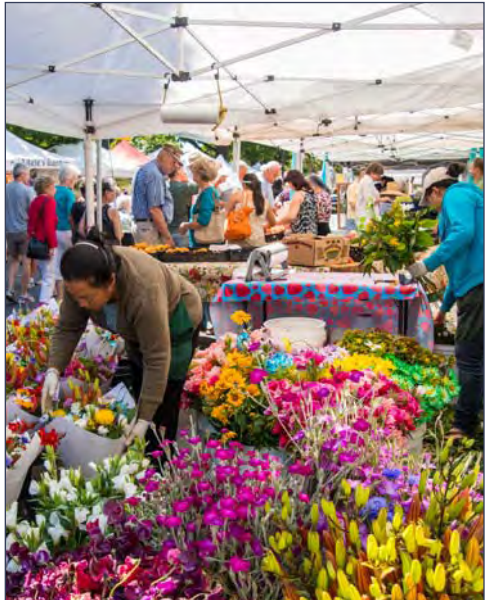
Flowers and produce at the Saturday Market