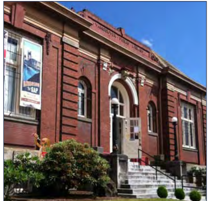
Historic Carnegie Library in Vancouver, which now houses the Clark County Historical Museum